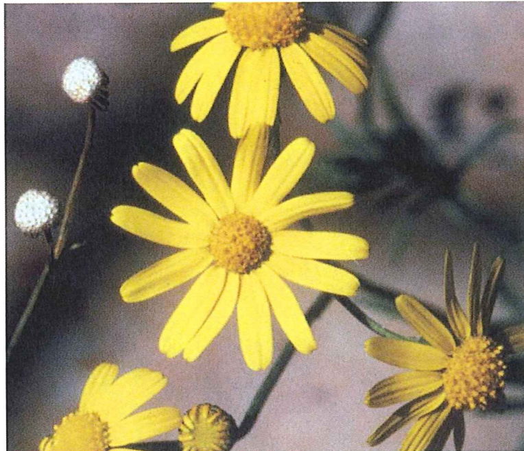
Fireweed flower showing 13 petals