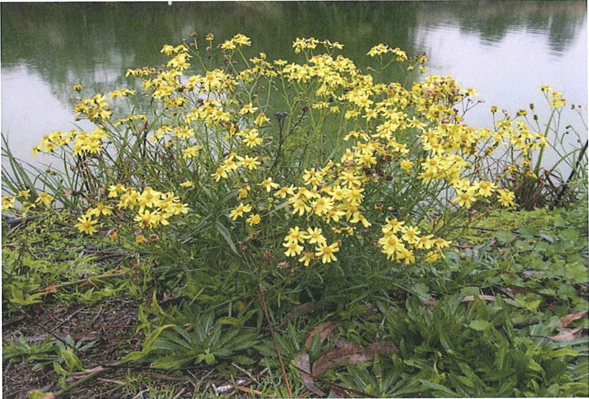
Fireweed is a heavily branched daisy like plant.