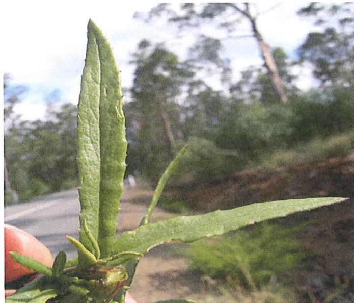
Serrated leaf margins of Fireweed

Fireweed has been recently located in the ACT and also on the Monaro Highway near the border. Fireweed is a serious pasture weed of coastal New South Wales. It is able to grow on most soil types and in all aspects.